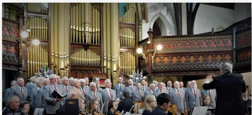
MMCSA & Orchestra performing at Songs of Faith

We hope to see you again at our upcoming Friends Concert on the 19 th of May or Variety Concert on the 18 th of August.