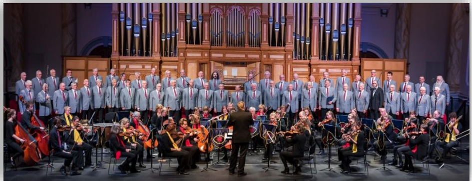
The MMC at the 2017 Proms with the Mt Barker Pipes and Drums and Scott's Highland Dancers (above) and the Metropolitan PROMS Orchestra (below).